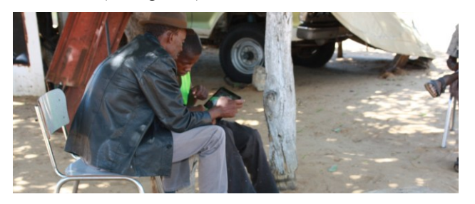
Figure 4 - two generations design with the prototype.