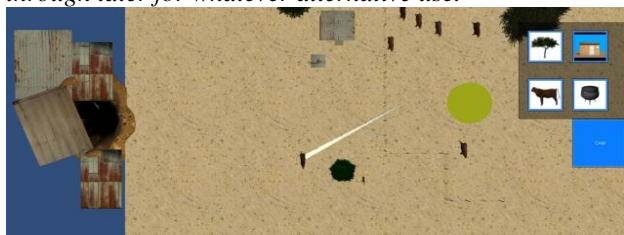
Figure 9 - a spatial overview of the being-created virtual homestead

them somewhere to re-use later for a different purpose. Thus, a more adequate implementation might be a site for storing for removed objects that villagers could pick through later for whatever alternative use.