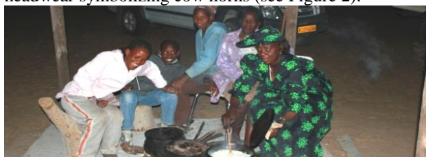
Figure 2 - Traditional headwear and Victorian inspired dress.

Erindi-roukambe is a small village located in the Kalahari Desert in the East of Namibia. At first sight, we observe that the people in the village, have evident colonial adaptations from Victorian times, such as the clothes, but yet they remain tightly bound to indigenous traditions. E.g. the women wear Victorian inspired dresses, but also headwear symbolizing cow horns (see Figure 2).