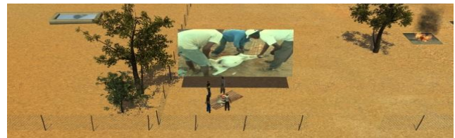
Figure 4 - instantiated 2D plane with IK video showing how to slaughter a goat.

Figure 4 depicts a running IK video being spawned as a floating 2D plane with sound. The ambition is not to visualize IK per se but to provide a meaningful interpretation enhanced through meta-data by visualizing place, people and actions in scenarios.