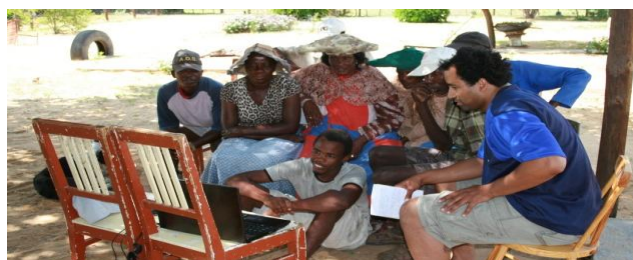
Figure 11 - Village elders, women and 'walkers' discuss the 1st. 3D visualisation prototype

We feel confident with this approach since translating from Otjiherero to English and vice versa might be a bias to our results and the fact that we had no experience interacting with these complicated group hierarchies and customs, made the approach the only proper solution for sharing the design with the community.