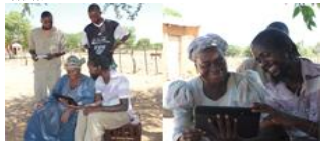
Figure 12 - Local facilitators discussing the prototype with some of the women in the village.

In the beginning the three young men reluctantly initiated interaction with relatives and people from the village, but after only a handful of sessions with a high frequency of adjusting questions and discussing procedure, we were once again out of the loop. This new approach to discussing design between two parties where the whole setup was completely new to both of them- was highly interesting on various points. E.g. the new facilitators could ease the whole setup with one comment, due to their shared Habitus and humour with the village people (see Figure 12). We, as developers have especially in unfamiliar field test setups, a tendency to stick to the script and scrutinize our field notes with instructions meticulously shaped from our offices –focusing on results.