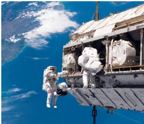
Figure 5: Two spacewalkers.

Some teleoperation interfaces appear to work well without a high level of immersion (e.g., for remote drone control, see Figure 4); thus, they should also be covered by our classification. While we do not focus on collaborative Augmented Reality (AR) systems, our classification extends naturally along a “transport” dimension [2] to less immersive systems and, therefore, covers many of such systems.