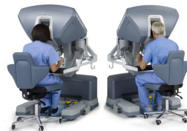
Figure 3: Multi-user telesurgery system: both surgeons are able to control the surgical system at the same time and over large distances.