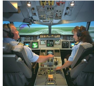
Figure 1: Multi-user flight simulator.

In our experience, this kind of communication between immersed users and non-immersed humans in various roles (e.g., co-workers, expert advisors, trainers, apprentices, etc.) is very common and occurs regardless of whether a teleoperation interface is designed to support it or not. In fact, this kind of communication is probably the most common form of communication during the use of teleoperation interfaces.