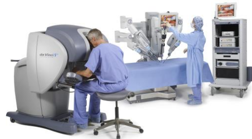
Figure 2: Telesurgery system for one surgeon (left). An assistant (right) is able to see the endoscopic view and draw lines on a touchscreen to visually communicate with the surgeon.