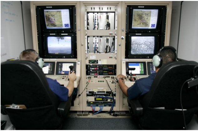
Figure 4: Multi-user drone control.