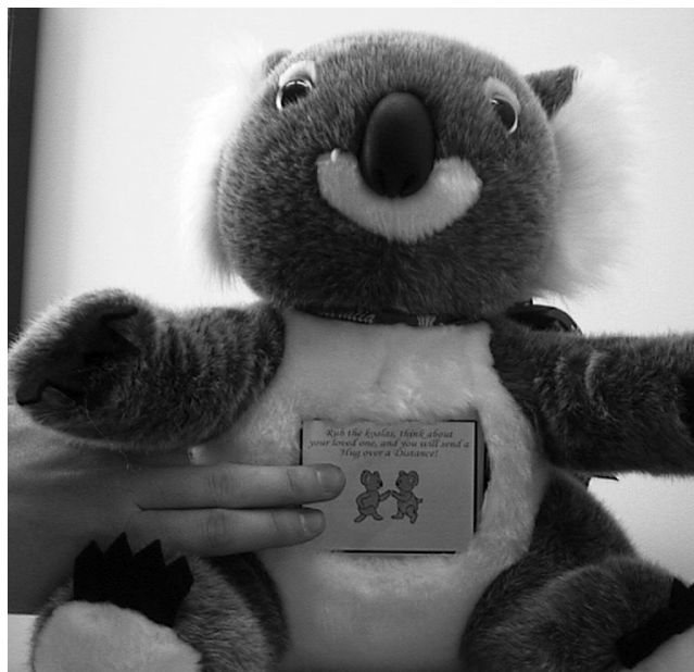
Figure 2. The wireless koala is currently a placeholder for a second vest.

It is important for us to emphasize that our intention is not to recreate accurately the physical and emotional experience of a real hug. Rather, we want to demonstrate, using a piece of wearable computing, that it is possible to send an “emotional ping” to a remote loved one with a tactile and unobtrusive interface. We are referring to a “hug”, because the feeling of light pressure around the body, combined with the associated warmth it creates, most closely resembles a hug.