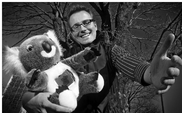
Figure 1. Rubbing the koala sends a wireless Hug over a Distance executed through the vest.

Task-oriented technology, such as email, videoconferencing and mobile phone voice and text communications were initially invented to increase efficiency in communication and collaboration. However, people often adapt them to satisfy their needs for social interaction: Flirting, chatting or finding marriage partners with these technologies are all lucrative businesses today, even though the initial designers surely did not envision such uses.