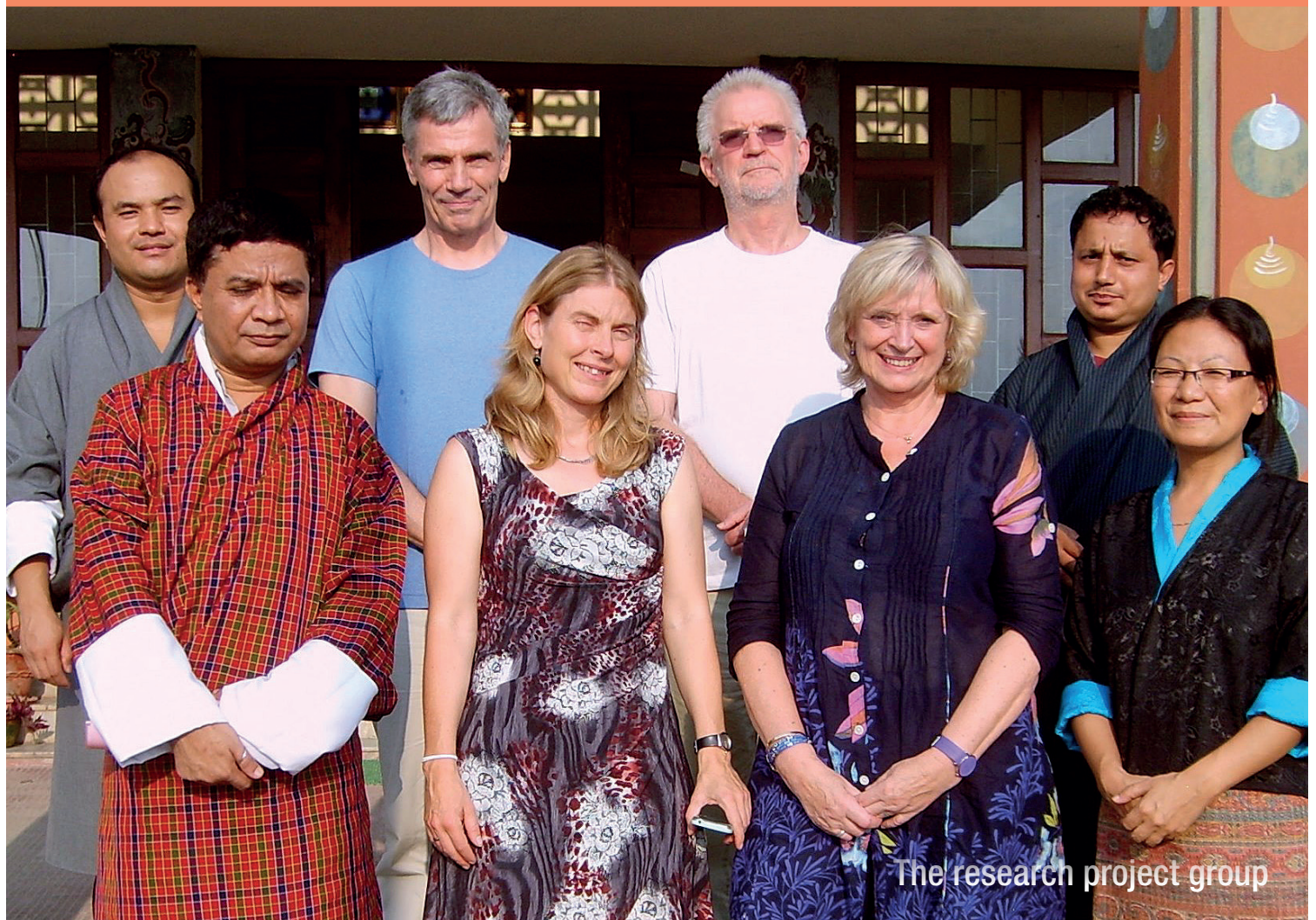
The research project group