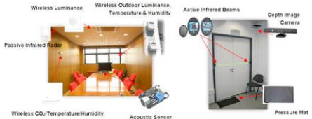
Fig. 4. IoT monitoring sensors deployed at CERTH building.