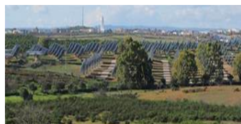
Fig. 8. Smart energy system in Portugal.

The DEMO site is focused on transversal energy domain and municipal buildings management. Energy generating and consuming components could potentially form a municipal-scale smart-grid enabled by VICINITY. It aims to demonstrate value added services that could be enabled through the VICINITY framework based on renewable energy generation infrastructure.