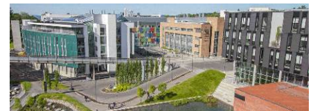
Fig. 6. Intelligent building system in Norway.

This use case will target the interconnection of smart objects under a “virtual neighbourhood” of intelligent buildings,