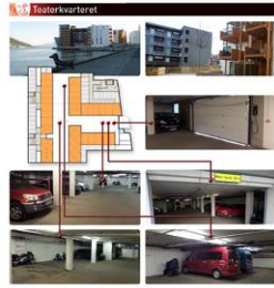
Fig. 7. Smart parking use case.

The Smart parking demonstration is located in Tromsø, Norway offering an extendable service for sharing available parking space. The initial test site is located in a newly constructed cluster of a living community for residents, elderly and young people, some of them requiring health and assistive service from the municipality. The area consists of apartment buildings, offices, theater and amusement activities with less and less outdoor parking space.