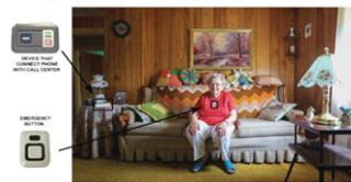
Fig. 9. eHealth/assistive living home.

This Use Case will demonstrate how sensors, actuators and integrated communication devices installed at home can provide assistive living to elderly people and people with long terms needs, allowing remote monitoring of end-users' health parameters and providing them direct means of communication with a 24-hours call center with specialist staff in case assistance is needed.