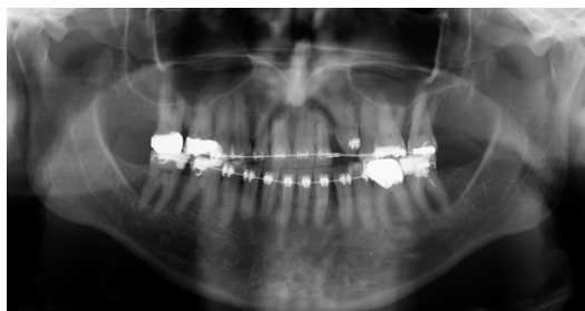
Figure 2. Panoramic radiograph of the maxillary upper left canine revealed bony impaction with lack of periodontal ligament. There was no apical pathology and sufficient interradicular space between the adjacent teeth.