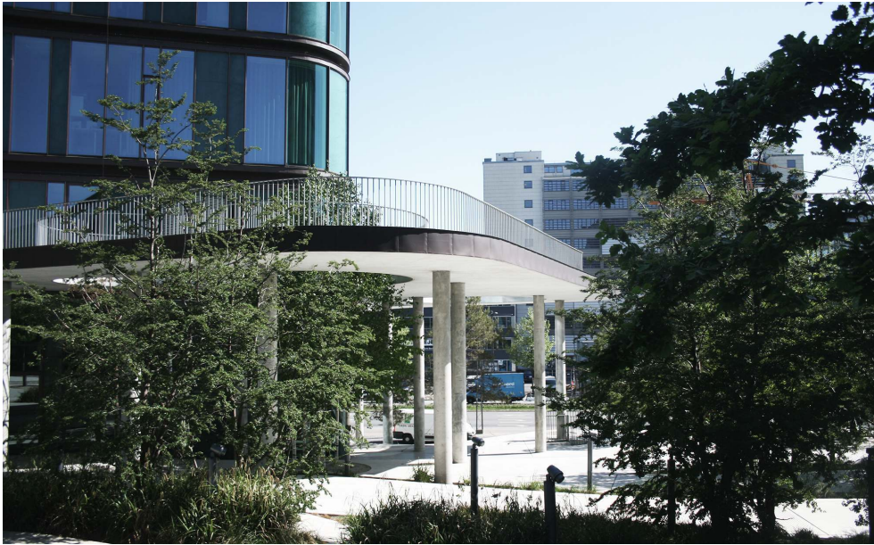
Illustration 7: Facade detail