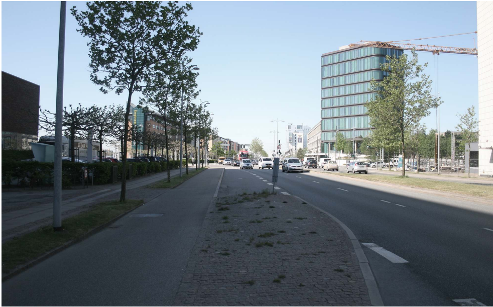
Illustration 1: SEB bank in context