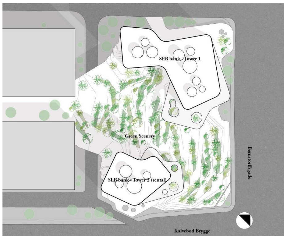
Illustration 3: Plan drawing of SEB bank 1-1.000