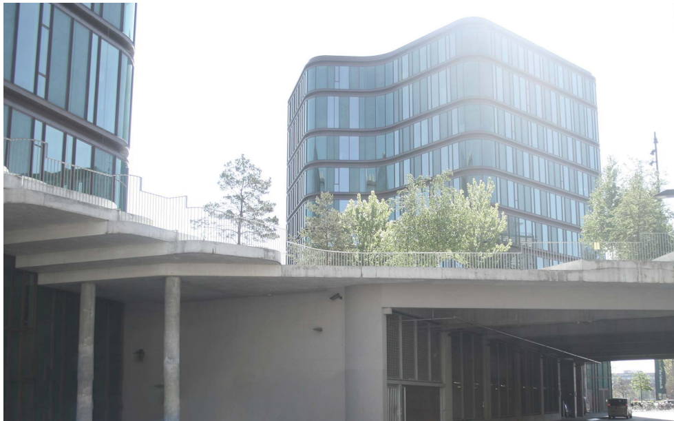
Illustration 5: The parking garage below the green scenery