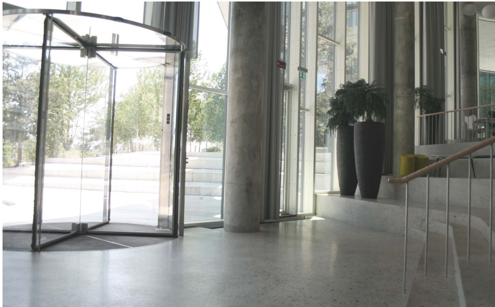
Illustration 6: The concrete curvatures continue from exterior to interior through the glass membrane