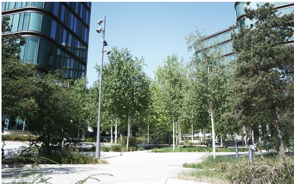
Illustration 4: The urban scenery

between traditional architecture and urban design appears. Below the green scenery, there is a parking garage servicing the towers. Here, a functional demand for parking and technical demands for rainwater management and wind barriers are solved by constructing a partially underground parking garage, topped with artificial green urban scenery. Vegetation is used as windbreaks, to decrease the albedo effect and to manage rainwater, but also to nurture an ambiance that seemingly enhances the liveability for the workers in the office towers, as well as for citizens who are likewise generously invited to enjoy the space. The green scenery contains a rich diversity of trees and grasses, but also distinctive spatial experiences. At a general level, this approach to design, where the specific design solution solves technical challenges and provide qualities of ambiance, can be associated with a tectonic approach to design (see illustration 4).