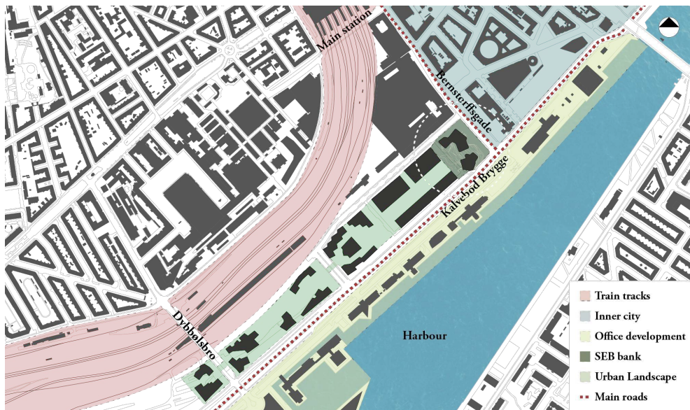
Illustration 2: Contextual drawing1-10.000