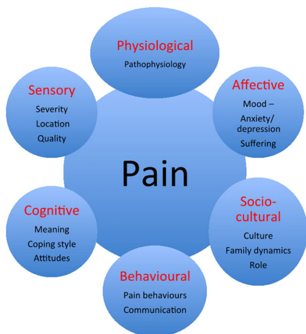
Figure 1 The multi-dimensional concept of 'total pain'.

and socio-economic impact of chronic pain is considered to be at least as great as that of other established healthcare priorities, including cardiovascular disease and cancer (Breivik et al., 2013). Pain reduces patient quality of life, preventing many from leading an independent lifestyle. This can also negatively affect the lives of their family, friends and co-workers (West et al., 2012). The Declaration of Montreal states that pain management is inadequate across most of the world (IASP, 2012).