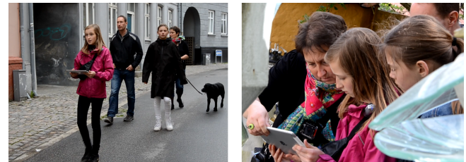
Figure 7. Child in charge of the iPad (left) and parent assisting the child (right)

Figure 7). If there were multiple children, the children not holding the iPad would often have a hard time participating in the navigation and would just follow the group. This indicates that the design does not fully encourage collaboration between multiple players, and it is possible that the collaboration between child and parent naturally arises from the fact that parents are used to assisting their children. During this collaboration however, it was clear that if the riddles were too difficult for the children, but the parents knew the answer, the parents would give their children hints in order for them to solve the riddle. From this, it could be seen that harder riddles encouraged more communication and collaboration.