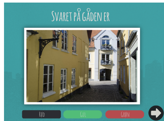
Figure 2. Control question after having found the landmark.

The last game activity is based on riddles and is similar to the game I Spy [32]. Players must spot a specific object in the vicinity based on a clue that is given to them. This approach is inspired by the LBG CityTreasure , where riddles are used at POIs. In the context of landmark navigation, the riddles describe saliency based on the visual, cognitive or structural attributes of the landmark, either in isolation or in combination (E.g. "I am tall and you can see through me"). In order for players to confirm that they have found