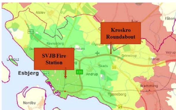
Fig. 1 Esbjerg Fires Station Response Time [8]

According to the fire station responsible for Esbjerg emergency services, Sydvestjysk Brandvæsen (SVJB), the Korskro roundabout on the outskirts of Esbjerg, a town located on western coast of Denmark, is prone to frequent traffic accidents. On average, 5-7 accidents per year are recorded on this roundabout. This paper analyzed the use of RED at a hypothetical traffic accident at Korskro roundabout. Response time is a critical factor in saving lives and FARS tries their best to reach the scene of accident in the fastest time possible. The response time from the Esbjerg fire station and the outskirts of the town is depicted in Fig. 1. The green area in Fig. 1 shows a response time of 10 minutes, while the yellow area represents 15 minutes of response time. According to the figure, the accident site of Korskro roundabout is in the green area and has a minimum response time of 10 minutes.