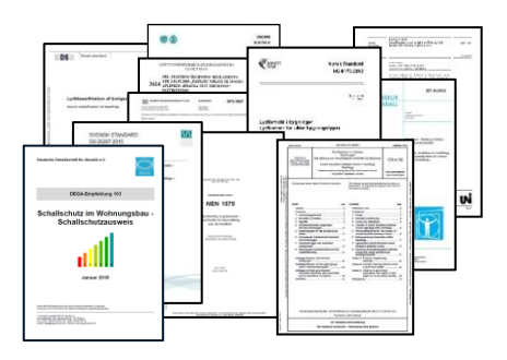
Figure 1. Acoustic classification schemes in Europe, examples of front pages of national documents published by standardization organizations or other organizations.

In this paper, classification schemes are limited to those having minimum three acoustic classes.