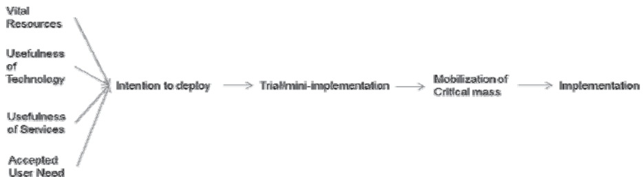
Figure 3. CBNM Model for Developing Countries

This loop continues until a critical mass of members was achieved to deploy the infrastructure. The existence of the iteration led to the process being christened the CBNM Loop for developing countries. The existence of this loop is as a result of the enthusiast, who believe and see the possibility of the project. Having explained the loop, the CBNM model for developing countries can be seen below.