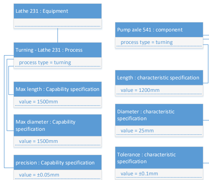
Fig. 2 UML object diagram showing example of specific equipment and component applying the ontology

component, e.g. an axle, the component type defines that the characteristics length, diameter, and tolerance must be specified for any axle, but when modelling the actual components, these characteristics are assigned values, e.g. length=1200mm, diameter=25mm and tolerance \pm 0.1 mm, which constitute the “characteristic specification” objects. This is illustrated in Fig. 3.