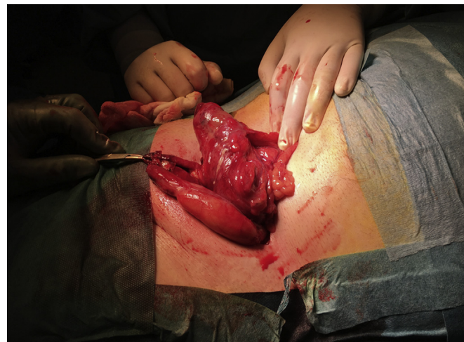
Fig. 2. The hernia sack was opened and access to the intra-peritoneal cavity was established. The colon was then retracted and the diagnosis of a hypertrophied EA was confirmed followed by an uncomplicated resection of the EA.

Operation under general anesthesia was performed via incision parallel to the left inguinal ligament. The size of the EA made several differential diagnoses possible (Fig. 1). Upon exploring the mass after incision, a rubber-solid smooth mass originating from the abdomen was palpated (Fig. 2). Sigmoid colon could be pulled and inspected through the incision. The diagnosis was confirmed