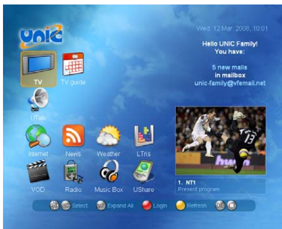
Figure 2. The UNIC portal Homepage

The STB Portal (see Figure 2) was developed by Eutelsat using TOIX and the JavaScript APIs. The STB Portal is an STB application providing the graphical interface and utilising the functionality in the STB subsystem.