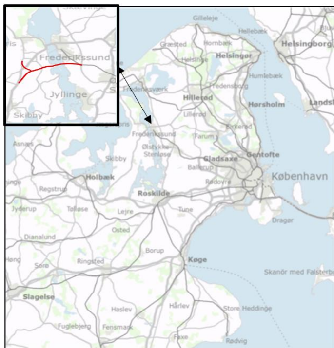
Figure 1. The Roskilde Fjord bridge project