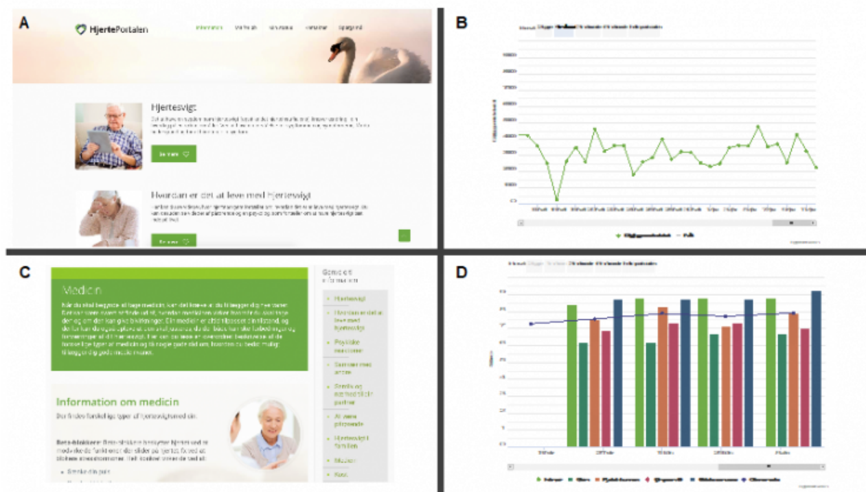
Figure 3. Screen captures from the HeartPortal. (A) Front page for the patients. (B) Measurement from the pedometer. (C) The information platform. (D) An illustration of the patient-reported outcome.

and screen captures are shown in Figure 3. The portal has been developed using a participatory design approach [19,21,22]. The HeartPortal consists of four elements: