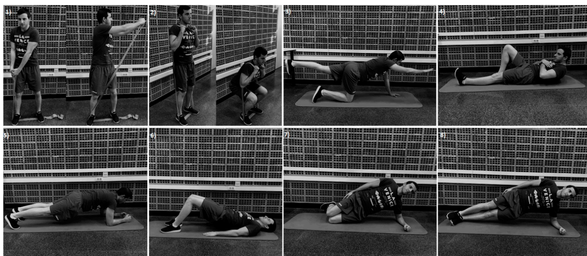
Figure 1. Exercises performed: (1) Torso-twist, (2) Squat, (3) Bird-dog, (4) Modified curl-up, (5) Front plank/front plank with brace, (6) Supine plank, (7) Lateral knee plank and (8) Lateral plank.

elastic band attached to the left feet, with arms positioned horizontally and extended, the patients had to twist their torso from left to right while maintaining feet, legs, and hip stationary); squat (from standing position with feet shoulder-width apart, with the band underneath the feet and the other extreme over the shoulders with both hands gripping the corresponding loop, patients were asked to squat until 90° of knee flexion); bird-dog (from a quadruped position, lifting a leg and the contralateral arm so that the hip and knee were fully extended and the shoulder flexed); modified curl-up (lying with the back on the floor, with one knee flexed and hands underneath the low back, the patients have to slowly raise the chest, shoulders and head); front plank (prone position with the elbows flexed to 90° and knees fully extended, only with the forearms and toes in contact with the ground); front plank with brace (as the previous exercise but with a bracing maneuver, voluntarily contracting the abdominal muscles); supine plank (knees flexed at 90°, both feet resting on the mat and the pelvis lifted and aligned with the thigh), lateral knee plank (in a side-lying position with the dominant side beneath and knees support, with the elbow beneath the shoulder, the other arm perpendicular to the ground, and the pelvis raised); lateral plank (as the previous exercise but without knees support).