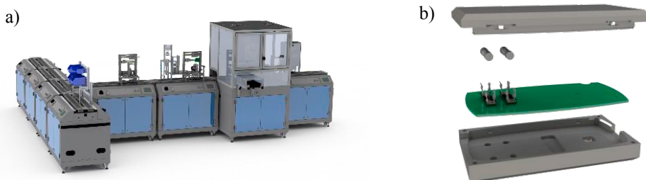
Fig. 1. (a) Illustration of the AAU Smart Production Lab; (b) Illustration of the dummy product.

Aalborg University (AAU) learning factory, AAU Smart Production lab, illustrated in Fig. 1a, is based on the FESTO cyber-physical didactic system and the principle known from changeable manufacturing systems [11,12]. AAU Smart Production lab is classified as a narrow sense of learning factory with the real value chain, on-site communication and physical manufactured product [13]. The AAU Smart Production lab manufactures a dummy cell phone, illustrated in Fig. 1b, consisting of a product house, circuit board, fuses, and product cover which can be manufactured in 816 variants.