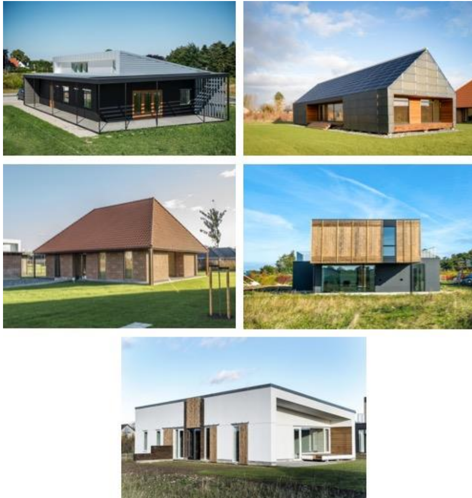
Picture 1-5. The five MiniCO 2 Houses. Picture 1, top-left: Upcycle House (UP). Picture 2, top-right: Innovative Maintenance-free House (IMF). Picture 3, mid-left: Traditional Maintenance-free House (TMF). Picture 4, mid-right: Adaptable House (AD). Picture 5, bottom-center: Quota House (Q). The Reference House (Ref) is not illustrated as it is a theoretical, standard house.

The main difference between the MiniCO 2 Houses is that they are designed to reduce impacts from different life cycle stages. The Upcycle House and Adaptable House are designed to limit impacts in the product stage, the Quota House is designed to reduce impacts in the use stage, while the two Maintenance-free Houses focus on reducing impacts in both the product stage and end of life stage.