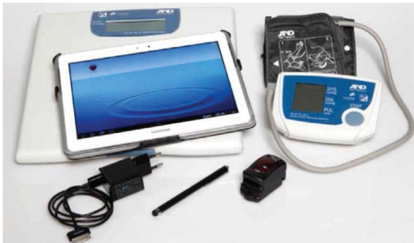
Figure 2: A Telekit that consists of a tablet, tablet pen, pulse oximeter, blood pressure monitor and a scale.

The tablet had two applications (apps) installed: First, a measuring and monitoring application containing health-related questions that also could collect and transmit the measurements made by the peripherals. From this application, the patient could also create an overview over historical measurement values and gain access to a message function that allowed for an asynchronously dialogue with a healthcare professional. Second, a training-application containing a digital version of the manual, several videos showing how the various parts should be used and a training video targeted the patient (108). The device was portable but could only be used inside Denmark (108). The provided tablet could be updated and managed