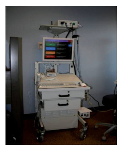
Fig. 2. The telemedicine device Pipaluk.

the Queen Ingrid Hospital in Nuuk, or a University Hospital in Copenhagen, Denmark.