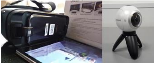
Figure 1. The VR-System, consisting Samsung Galaxy S7 phone mounted in a Samsung Gear VR, connected to a Nexus 9 tablet, and a Samsung Gear 360 to film 360° footage.