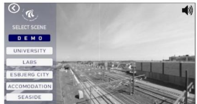
Figure 5. The Mute/Unmute button

Another function is the mute and unmute button on the tablet, as seen in the top right corner of Figure 5. The Mute/Unmute option turns off the application's sound. Figure 6 presents a guide with steps regarding the start-up process of the application. The empty space beneath the two buttons is allocated to warnings, in cases where the tablet would register a loss in connection.