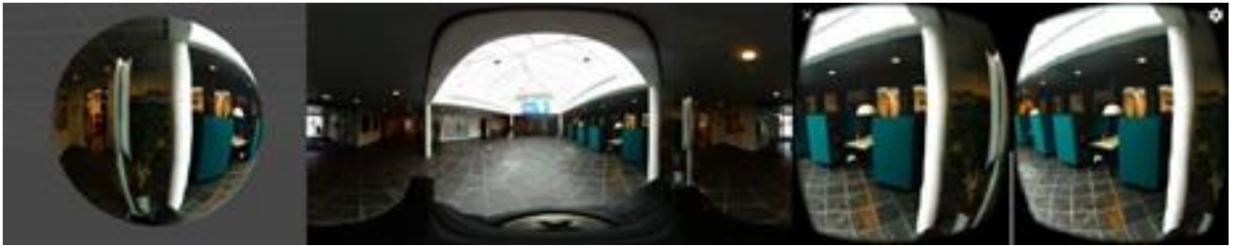
Figure 4. On the left: sphere providing omnidirectional view. In the middle: equirectangular projection. On the right: stereoscopic view.

The tablet is setup with the same UUID, thus being able to connect to the Samsung Galaxy S7 phone using Bluetooth. It uses a pre-connection interface that enables the user to manually search for the phone and connect to it. Once a connection to the phone has been established, the tablet switches to the standard interface (Fig. 2).