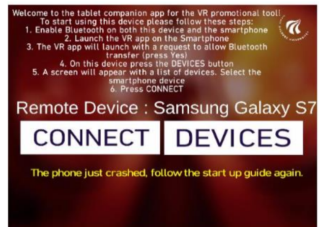
Figure 6. Application start-up guide