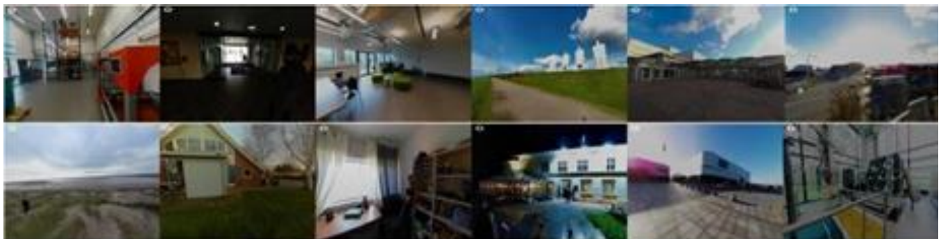
Figure 3. Photo examples of locations available to view in the application.

The connection between the tablet and the phone is established via a Universally Unique Identifier (UUID), which is a 128-bit number used to identify another Bluetooth device. This connection would send bytes of string values to each other. The tablet would send continuous updates on the current active scene, and the phone would send the xyz-rotation values from the gyroscope.