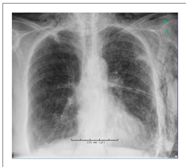
Figure 1. Chest x-ray taken prior to chest drain removal, showing no obvious signs of pneumothorax. SE can be seen, especially on the left side of the thorax and bilaterally in the nuchal area.

Previously, only a few articles have described the tardive development of SE. Tardive SE has for instance been described in relation to abdominal surgical procedures where SE arose after the termination of induced pneumoperitoneum, 9,10 up to days after the procedure. This is different to our case, as this relates to the abdominal cavity.