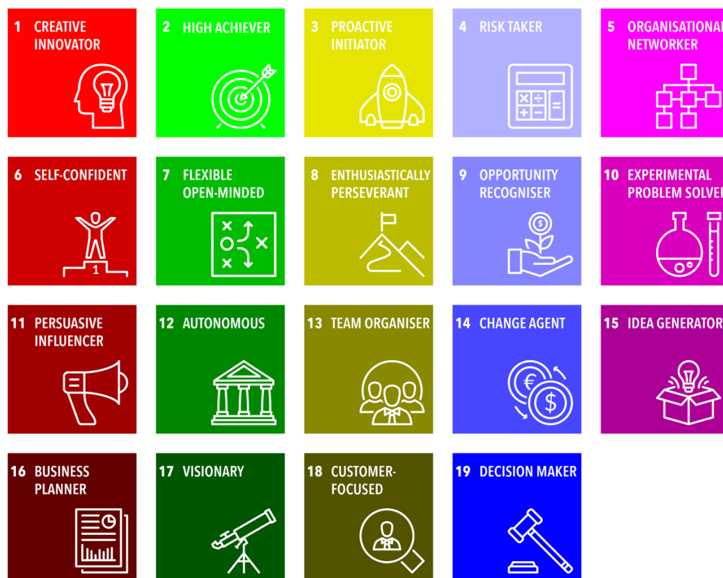
Figure 2: The 19 intrapreneurial characteristics.

The analysis revealed 19 characteristics of intrapreneurs as shown in figure 2. The 19 characteristics are elaborately defined in the following.