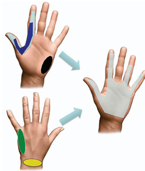
Figure 9.1 Schematic representation of the areas of the patient's phantom hand involved by the sensation during intraneural stimulation. On the left side of the picture, the areas of the phantom hand where the patient felt the sensation stimulating with five channels individually can be seen. On the right side of the picture, the area of phantom hand where the patient felt the sensation by stimulating simultaneously with the same five channels can be seen.

During the 10 days of treatment, the patient described a significant and progressive decrease of his phantom limb pain (Figure 9.2) that was referred as less “stabbing”, “sickening”, “sharp”, “fearful”, “gnawing”, “cramping”, “hot”, “aching” and “heavy”. The patient experienced a maximum decrease of pain intensity from 9 to 4/5 according to the VAS. A sensation of partial opening of the phantom “clenched fist” was also referred by the patient together with the pain decrease. However, the effect of treatment was of short duration lasting only some hours after therapy; during the first three days of therapy (lowest VAS score between 6 and 7, PPI score 4 and McGill score between 12 and 20), the pain came back to normal before the patient went to sleep, whereas during the last days of therapy, the relief from pain lasted until the patient went to sleep and pain came back to normal when the patient woke up (lowest VAS score between 4 and 5, PPI score 3 and McGill scores between 6 and 9).