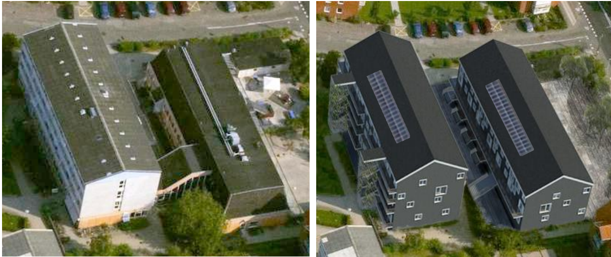
Figure 1. Sems Have/House of youth before (left) and after (right) the renovation. Not only the interior but also the exterior went through a major renovation.

Sems Have was originally constructed in 1970-72 under the name “House of youth”. The two buildings were a four-story building with a dormitory at the first to fourth floor, and an activity centre for school-children at the ground floor. The other building contained a day-care centre for small children at the ground floor and two smaller concert halls at the first floor. In 2011 the buildings were totally worn down and the housing association had to decide if the buildings should be demolished or refurbished. Based on economical calculations it was decided to refurbish the buildings and turn them into 30 modern low energy apartments. Figure 1 shows the buildings before and after the renovation.