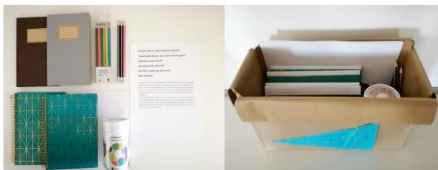
Figure 2: Cultural probe package for the dairy study.

In the diary phase, we obtained rich qualitative insights into the families' current practices around mobile device use and how that use shaped family relations. In this part of the study, we designed a self-reporting diary probe framed as a cultural probe [17]. The probe consisted of diaries for each family member, blank papers, pencils, colour pencils, and printed instructions and inspirational sentences (see Figure 2).