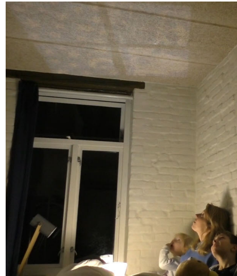
Figure 6. Both parent and children looking up to see shadow change.

In the follow up feedback session all parents mentioned that it worked well but that there were things that should be solved