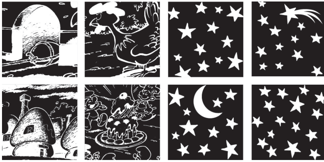
Figure 3. Electrochromic display designs. Left: 2by2 grid shows the story illustrations. Right: 2by2 grid shows the generic stars.

drop. Through the projected images we hope to encourage a conversation about the story which further can stimulate and support dialogic reading. Illuminating with soft light should provide enough light for reading a story without needing to add extra lights in the room and without disturbing the shadow projection abilities of the lamp. The lamp projects four separate shadows onto the ceiling arranged in a two by two grid projecting one big rectangular shadow with each separate projection switchable between two shadow patterns. The frame of the lamp contains four holders for electrochromic displays that enable the switching of shadow patterns. This allows the lamp to be used with different stories or for different purposes than just augmenting points in a read story.