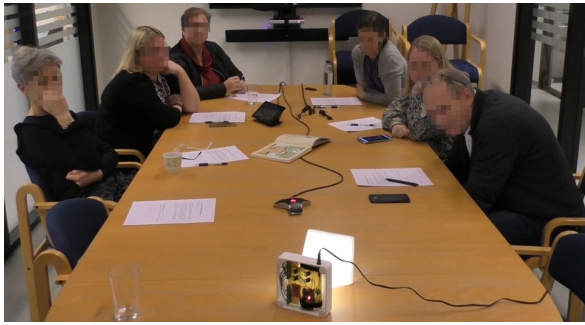
Figure 4. Focus group in progress. Participants trying out lamp control interface while being very interested in the display technology used to project shadows.

about other things". When asked whether there were things in the books that made them more popular (story or amount of pictures), story was the most prominent answer with relatable books being most popular "We've read a lot of Villads from Valby. They can relate to that because it is about a schoolboy". None of the participants were aware of dialogic reading as such and that they, to some extent, subconsciously had used this technique with their children in prompting "wh" question and discussed relatable plot points.