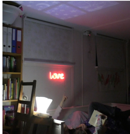
Figure 5. One child pointing towards ceiling in excitement of the changing shadows.

Following a short description of how the control interface works and how the reader can see in the book when to use it; the smart phone controlling the lamp was passed around for the participants to try out (see Figure 4). When asked whether they would change anything in the interface, they all agreed that due to the minimal amount of buttons present it is easy to understand. However there were suggestions to change the icons on the buttons to resemble the actual graphics being projected: "You could use stars or something that reminds of the pictures from the book", "Then you aren't in doubt where which button you have to click". Another problem that