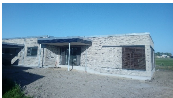
Figure 2. External northwest view.