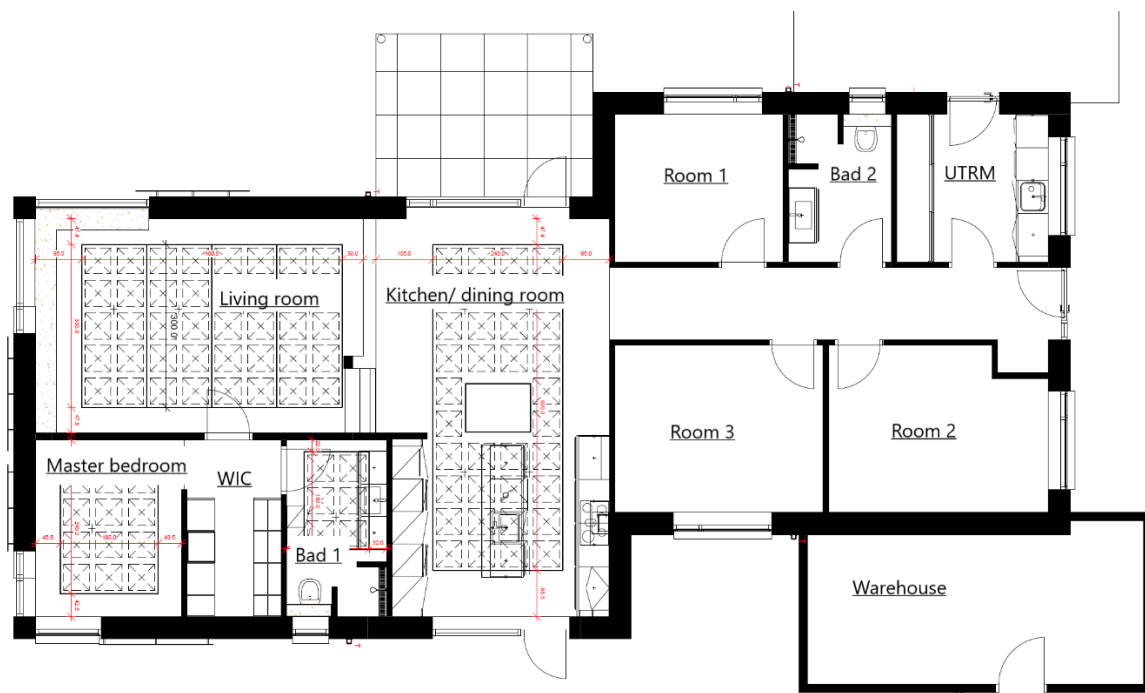
Figure 1. Floor plan of the study case.

The characteristics of the building study case are summarized in Table 1. The building is occupied by a young couple. The windows are triple-pane low-energy windows, with high light transmittance and low solar heat gain factor.