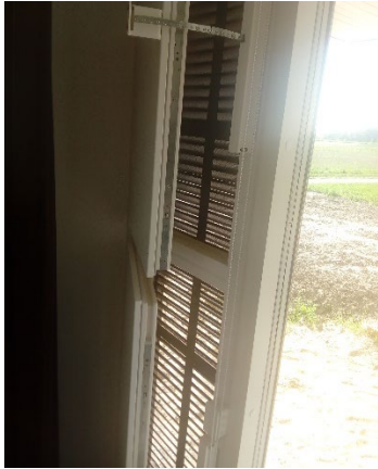
Figure 4. Ventilation louvers.

automatically controlled. The examined period for this report only covers the period with manual activation of these systems.