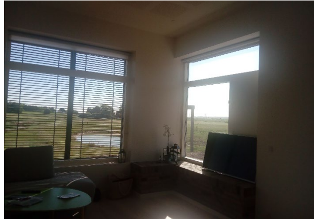
Figure 5. Solar shades and view to the outside.