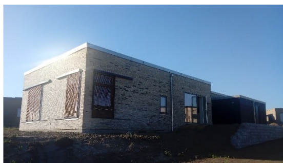
Figure 3. External south view.