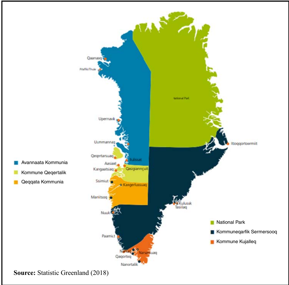
Figure 1 Greenland’s municipalities and the national park

Naalakkersuisut, for instance, focuses on fostering tourism growth by “developing areas, cities and towns through spatial and urban planning” (field interview, TJ, January 20, 2017). Additionally, laws and guidelines aim to regulate and manage the arrival of tourists while simultaneously enabling tourism actors to operate their businesses through activities such as fishing and hunting licenses and cruise-ship passenger fees (Naalakkersuisut, 2015). Greenland’s destination marketing organization (DMO), Visit Greenland, focuses on the marketing and global promotion of the country as a tourist destination (VisitGreenland, 2016). Lastly, small-scale actors are primarily occupied with tackling day-to-day challenges that are related to changing regulatory frameworks, unreliable and high-maintenance technical infrastructure, complex logistics due to geographic dispersal and high seasonality (Ren and Chimirri, 2017). There is a need for a stable “framework [...] The government keeps changing [...] direction. There is no steady framework and uncertainty increases [...] We’re very concerned. We see that tourism has major potential,