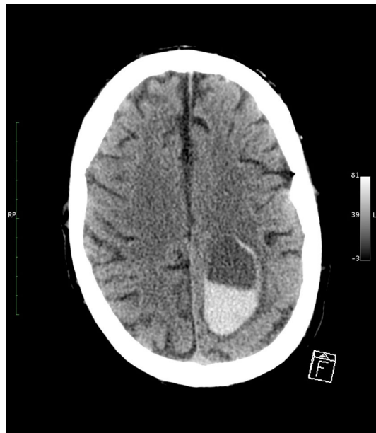
Figure 1. Typical blood-fluid level on an acute CT scan of a patient with an intracerebral hemorrhage in the left parietal lobe.

suggested as a marker for OAC-ICH 11,12 , but with the exception of one study (a sub-study of INTERACT-2) most published studies are case reports or were done on small samples 11–15 . In a study of 2065 patients from the INTERACT-2 study, blood-fluid levels on baseline CT (found in 19 patients in the sample) were associated with the use of warfarin as well as poor outcome 90 days after ICH 16 .