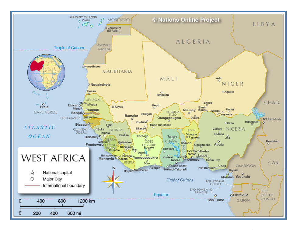
Image 1. Political Map of West Africa borrowed from the Nations Online Project.<sup>6</sup>

Plan identified four areas of action to be prioritized and reinforced – three of which directly reflect the EU's Justice and Home Affairs agenda: 1) Preventing and countering radicalisation, 2) creating appropriate conditions for youth, 3) migration and mobility, 4) border management, fight against illicit trafficking and transnational organised crime (Council 2015: 5). Under the Partnership Framework for Migration, 4 launched in 2016, five sub-Saharan states were selected as EU foreign policy priority countries – of which the three that receive the highest amounts of funding through EUTF are found in the Sahel region: Senegal, 5 Mali and Niger. This thesis explores how the EU's crime control policies and models have travelled to these three countries.