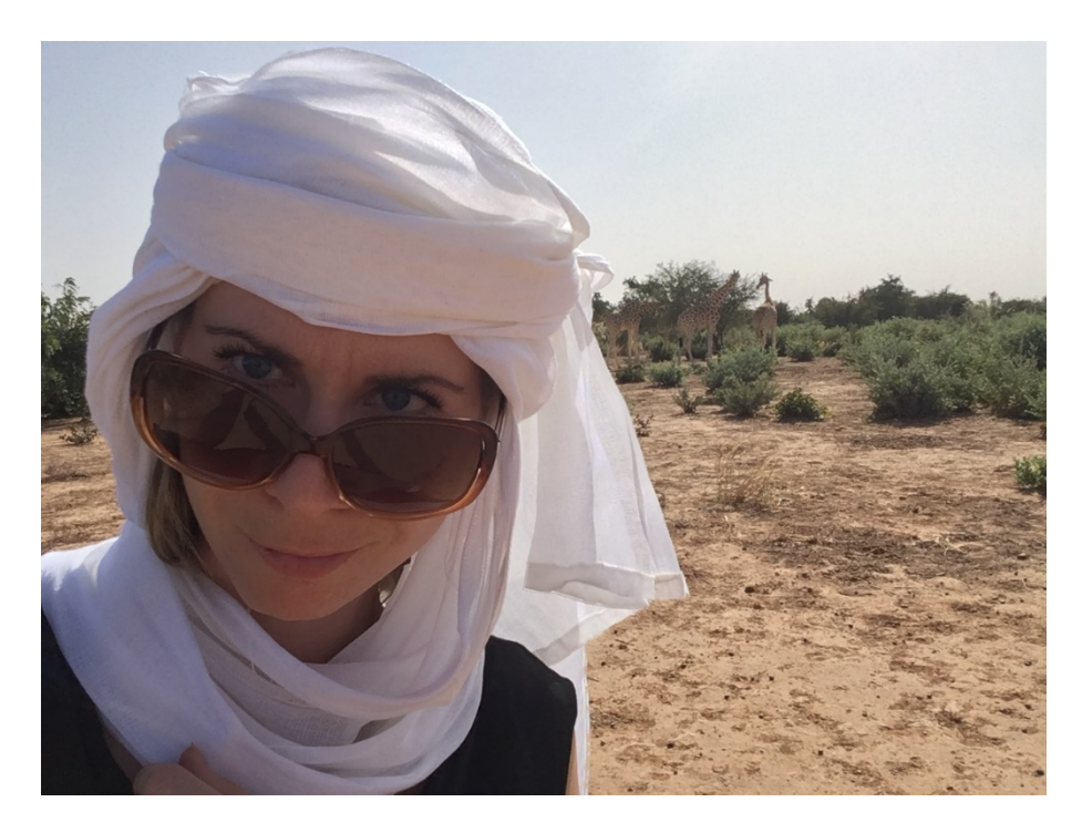
Image 6. With West Africa's last wild giraffes in the background, outside Niamey, Niger.