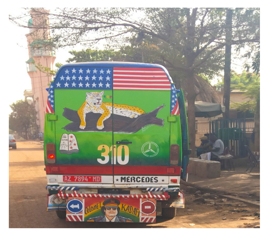
Image 3. Gaddafi was an important regional hegemon with substantial influence in Niger, Mali and other sub-Saharan countries. This photo shows that his legacy is still alive and well, depicting Colonel Gaddafi painted on the back of a bus in Bamako.

The fall of Gaddafi in 2011, instigated by NATO's bombing of Libya, significantly altered the security landscape in the Sahara-Sahel and was among the causes of the 2012 Touareg rebellion in northern Mali (Bøås and Utas 2013). Touareg living in Libya, some of whom had served in Gaddafi's army, returned to their old homeland of Azawad <sup>17</sup> in northern Mali and Niger with armoured vehicles and heavy weaponry. The Touareg have a long history of rebelling against the (Bambara-dominated) central government in Bamako and the (now Hausa-dominated) government in Niamey, notably in 1962-64, 1990-95 and 2007-09. However, as opposed to earlier rebellions where combatants were poorly armed and easily overturned, the 2012 rebels were