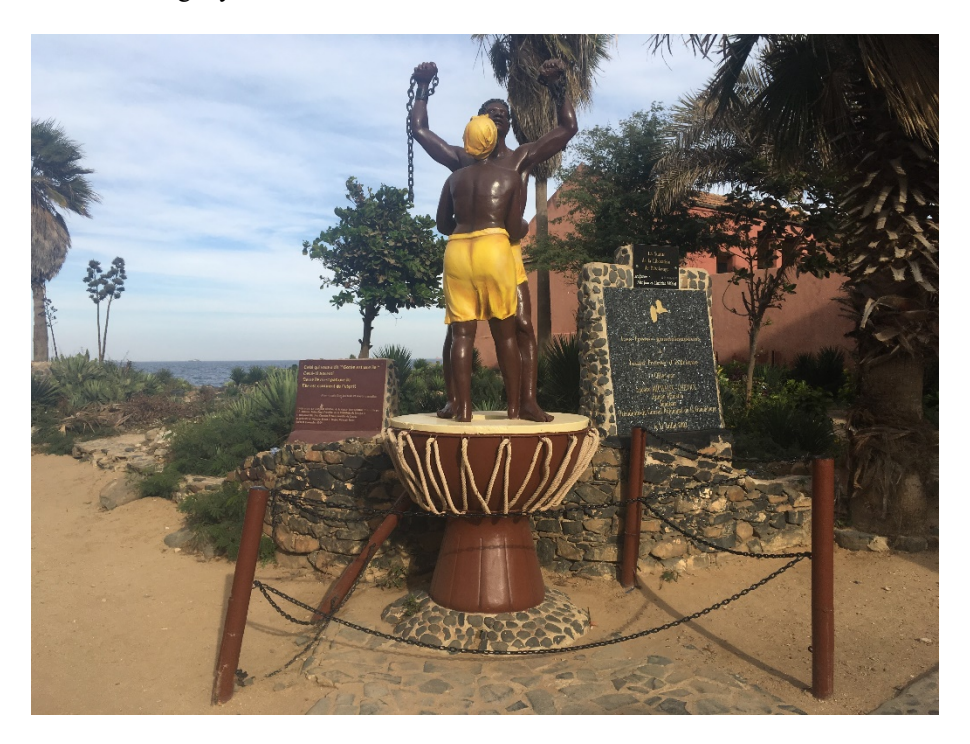
Image 4. Sculpture depicting freed slaves on Gorée Island outside Dakar, Senegal, which served as an important node in the transatlantic slave trade. The island has frequently changed hands, being owned at different times by the French, the British, the Portuguese and the Dutch.

and that the level of development in the West could only be sustained through the persistence of underdevelopment in the periphery (Ellison and Pino, 2012: 45-46). In other words, development was seen as retarded by exogenous factors such as unfavourable trade terms and exploitation. Still, dependency theorists did not write much about crime (Cohen 1988). Ellison and Pino (2012) criticize dependency theory mainly for the solutions its proponents propagated: that countries in the Global South should 'delink' from the global economy. Yet, they argue that the analyses and critique of the 'dependentistas' are still very valuable for understanding the global diffusion of crime policies today, and they develop their analytical framework along similar but slightly modified lines.