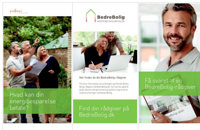
Figure 2. The 'Bedre Bolig' ('BetterHouses') campaign - www.BedreBolig.dk ( https://spareenergi.dk/forbruger/vaerktoejer/bedrebolig ).