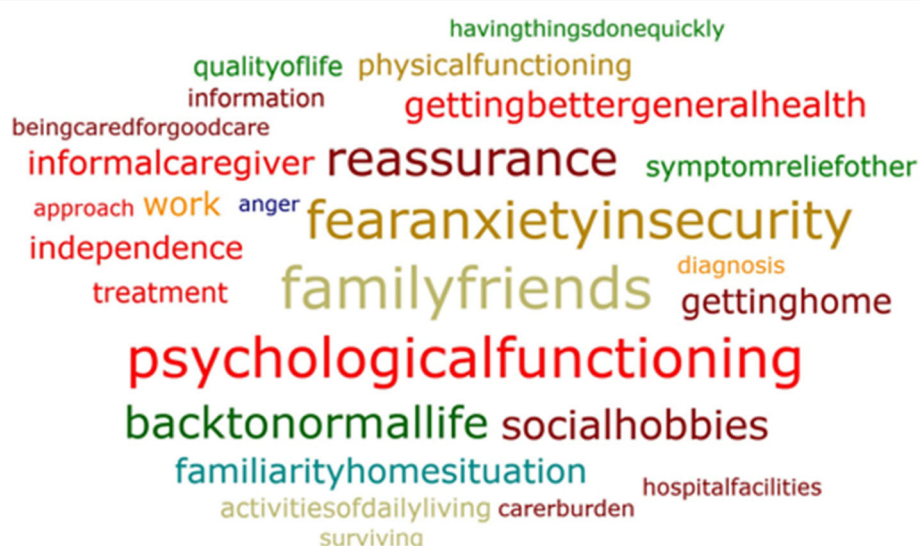
Fig. 3 Word cloud of 'Why does this matters most'

More than half of all patients (51.9%) felt their treating doctor did not know what mattered to them most. Of