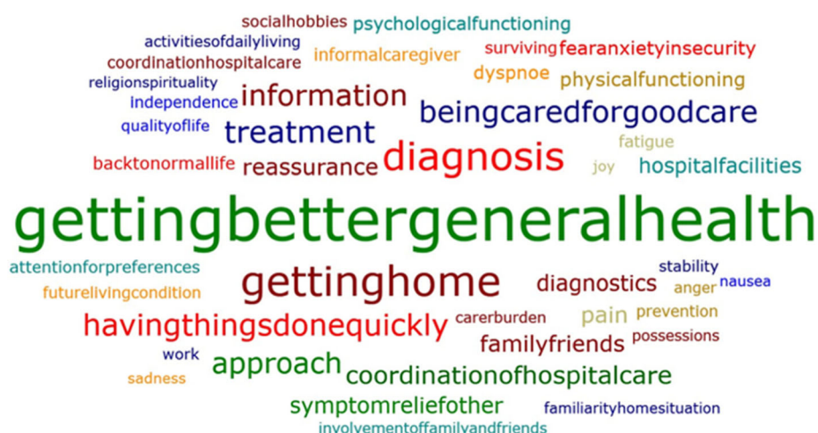
Fig. 2 Word cloud of 'what matters most'

around." (M, 71-75Y, The Netherlands), "At home I feel most comfortable, they have no dark beer here." (M, 86-90Y, The Netherlands), "To get home to my wife and our 3-year old daughter. My wife is expecting, I just cannot bear the thought of her giving birth without me." (M, 41-45Y, Denmark), "My husband is 80. It is more difficult for him to visit me in hospital now." (F, 67-80Y, United kingdom), "Wish to get home to my daughter- in-law's 50th birthday on Friday." (M, 66-70Y, Denmark).