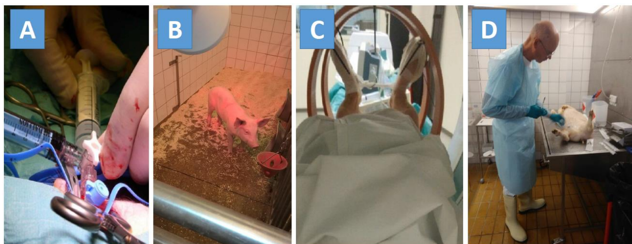
Figure 1. Step-by-step procedures for haematogenously induced osteomyelitis in a pig model used for comparing new tracers with known tracers: (A) Inoculation with a porcine isolate of Staphylococcus aureus in the right femoral artery of anesthetized 20 kg domestic pigs. (B) For the next seven days, the pigs were treated with painkillers and their clinical signs were scored every eight hours. If signs of bacteria spread to internal organs (cough, severe fever, tachycardia, anorexia, or inactivity) and thus septicaemia was observed, the pig was euthanized as a result of the pre-set humane endpoints. (C) After six days the pigs were CT scanned for verification of visible osteomyelitis, and the next day (day seven after inoculation) the pigs were exposed to the PET scanning program with several known and new osteomyelitis tracers. Both dynamic and static scans were performed, and blood samples from the carotid artery were collected and used to establish blood–activity curves and metabolite analyses. (D) At the end of the scans, the pigs were euthanized during the anaesthesia with an overdose of pentobarbital, after which a regular necropsy of the pigs was performed. This was guided by the findings from the CT scans the day before. The necropsy was performed to disclose the location and character of the various induced lesions so that the effectiveness of the tested tracers could be evaluated relative to the necropsy findings. Bacteria from lesions were cultured to determine if they originated from the inoculated bacteria strain.

robust model [8–10]. In the present review, we will generalize our experience and put it into a broader context. Where relevant, we have supplemented the review with a literature search (keywords used in PubMed in different combinations: animal models, osteomyelitis, tracer development, PET, imaging). However, it is important here to state that this is not a systematic review but is mainly based on our own practical experience as researchers, put in the context of a broader literature survey.