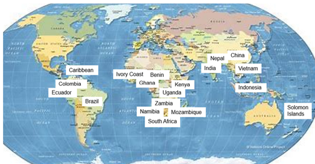
Figure 2. FFPLA Country assessments and implementations addressed in this Special Issue.

In recent years, the FFPLA concept has been introduced in many countries throughout the world for providing secure land rights at scale, within a short timeframe and at affordable costs. Figure 2 shows the range of countries where FFPLA assessment and implementation are addressed in this Special Issue.