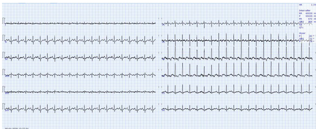
Figure 1: Initial ECG upon arrival: Supraventricular tachycardia with inverted T-waves in the precordial leads V3-V5. No previous ECG was available.

As a result of the echocardiographic findings and the elevated cardiac enzymes (CK-MB and troponin T), and the previously described ECG-changes, treatment was initiated due to suspected NSTEMI (non-ST segment elevation myocardial infarction). The subject was transferred to the department of cardiology and continuous heart rhythm monitoring was performed, but no