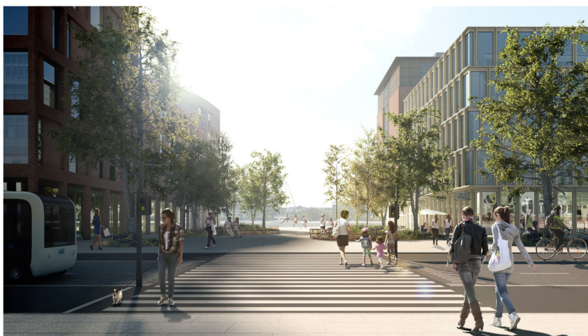
Fig. 5 CPH2050: Reconnecting the city. This figure is not covered by the Creative Commons Attribution 4.0 International License. Reproduced with permission of JAJA (2018); copyright © JAJA Architects, all rights reserved.

the expectations of a broad set of interests located outside the regime. These expectations represent discourses relating to the improvement of public transport, sustainability agendas, the improvement of citizens' welfare, and urban development. As a result, there is no single 'product' sold; rather, the product is a lifestyle contained within a particular form of urbanism. One can see overlapping similarities between this form of urbanism and wider landscape developments surrounding the metric of 'sustainable liveability', which has exploded over the past two decades through a series of city-ranking indices. Often, these indices tend to preference access to cultural amenities, cafes, bars, and restaurants, but they have also recently included less superficial metrics, such as housing affordability, well-functioning public transport, and access to clean water. While these rankings may seem innocent and objective, some criticise them for framing a particular expectation of what life and living in a city should be (Jacobs, 2014). Nonetheless, cities shape urban policy, strategy, and planning projects in pursuit of these rankings that draw in investment from around the world (McArthur and Robin, 2019).