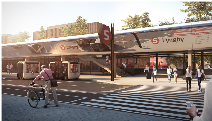
Fig. 7 CPH2050: From train station to mobility hub. This figure is not covered by the Creative Commons Attribution 4.0 International License. Reproduced with permission of JAJA (2018); copyright © JAJA Architects, all rights reserved.

Daimler, these depictions are not fixed, but co-evolve along with other system pressures. However, while the content within the image changes, the sociotechnical imaginary of a car-based society fundamentally remains the same. For Daimler, engaging with landscape pressures and emerging niches merely becomes an exercise in maintaining its own position within the system.