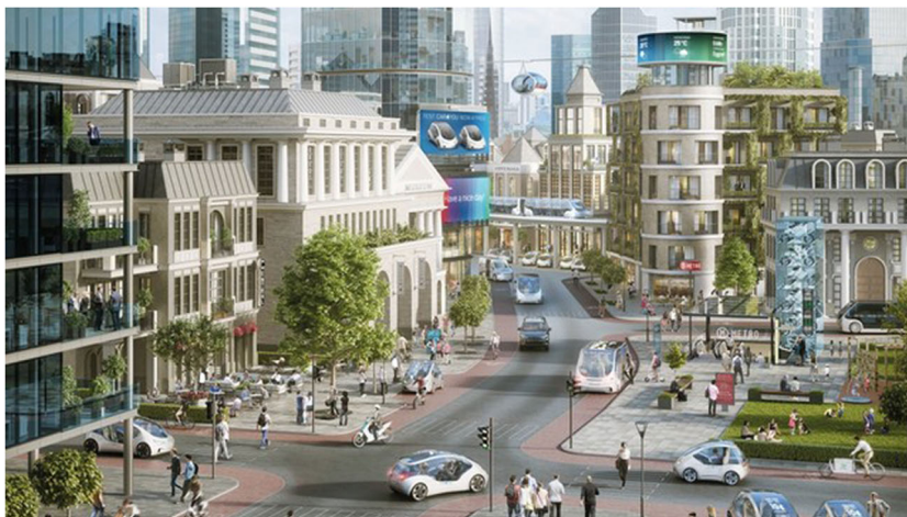
Fig. 3 Future mobility: Bosch and Daimler join forces to work on fully automated, driverless system. This figure is not covered by the Creative Commons Attribution 4.0 International License.