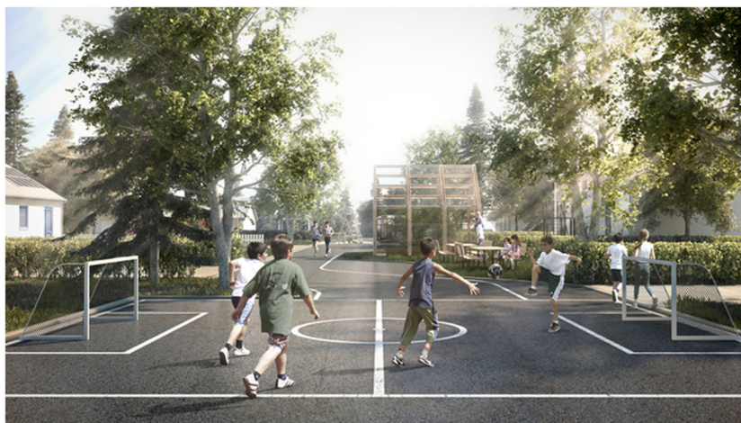
Fig. 6 CPH2050: Suburban transformation. This figure is not covered by the Creative Commons Attribution 4.0 International License. Reproduced with permission of JAJA (2018); copyright © JAJA Architects, all rights reserved.

fit for swimming. Furthermore, a single AV is represented as a shared shuttle waiting for pedestrians to cross. This action is enabled by the only other symbol of technology present in the image, traffic lights. Safety, therefore, is not communicated through technological systems as in Daimler's depictions, but rather through fixed spatial infrastructure and children safely crossing the street. Herein lies a continuing theme throughout each of JAJA's visualisations: The transformation of space will drive the transition towards future transportation systems.