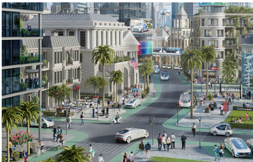
Fig. 4 Bosch and Daimler: Metropolis in California to become a pilot for automated driving. This figure is not covered by the Creative Commons Attribution 4.0 International License.