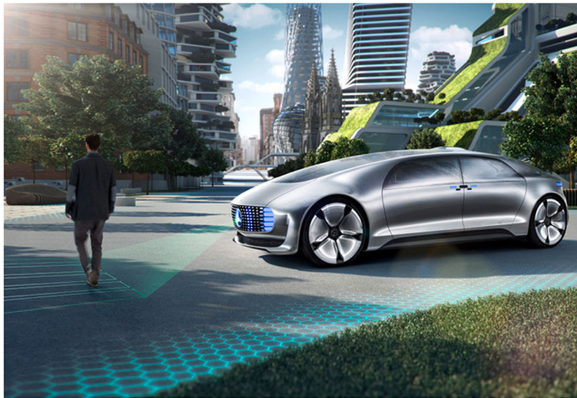
Fig. 2 Mercedes-Benz F 015 Luxury in Motion: A virtual zebra crossing indicating to pedestrians on the side of the road that it is safe to cross. This figure is not covered by the Creative Commons Attribution 4.0 International License. Reproduced with permission of Global Daimler Media; copyright © The Daimler Group (2015), all rights reserved.