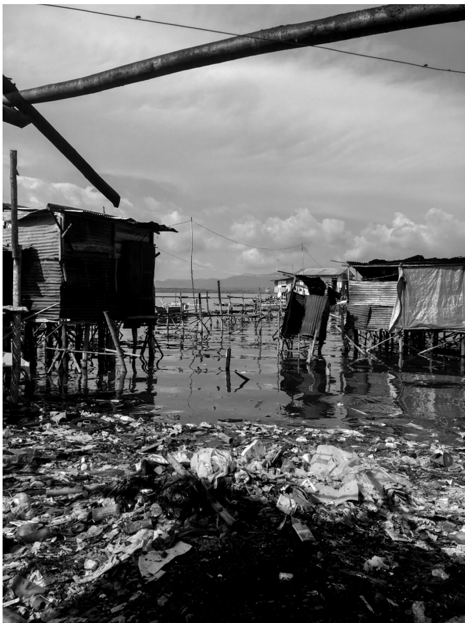
One of the Muslim barangays in Palawan after a fire the previous year, 2018.