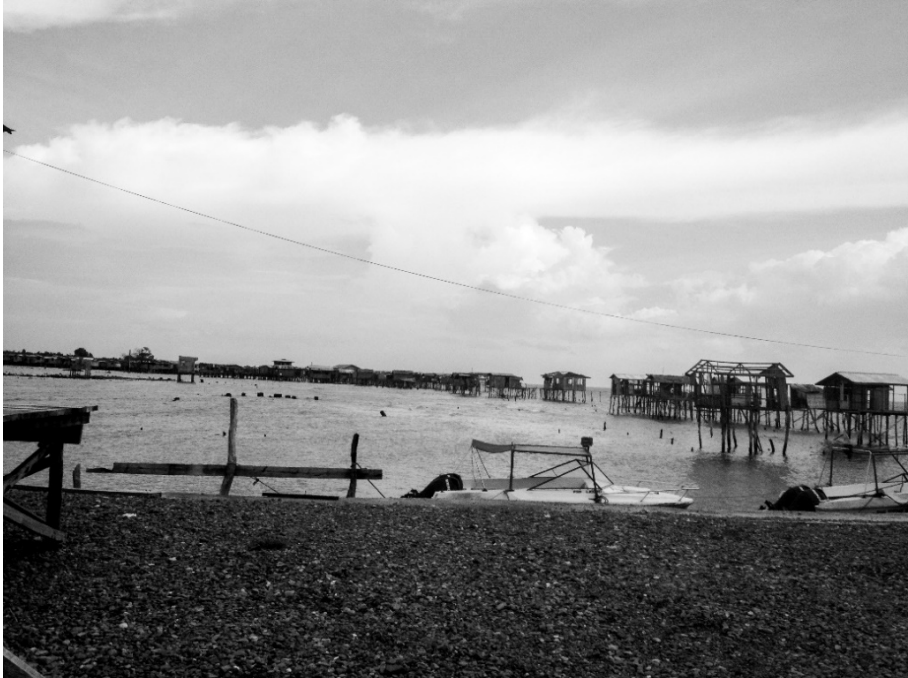
"Ground Zero" in Zamboanga a year after the fighting between the MNLF and the Philippine military in 2013.