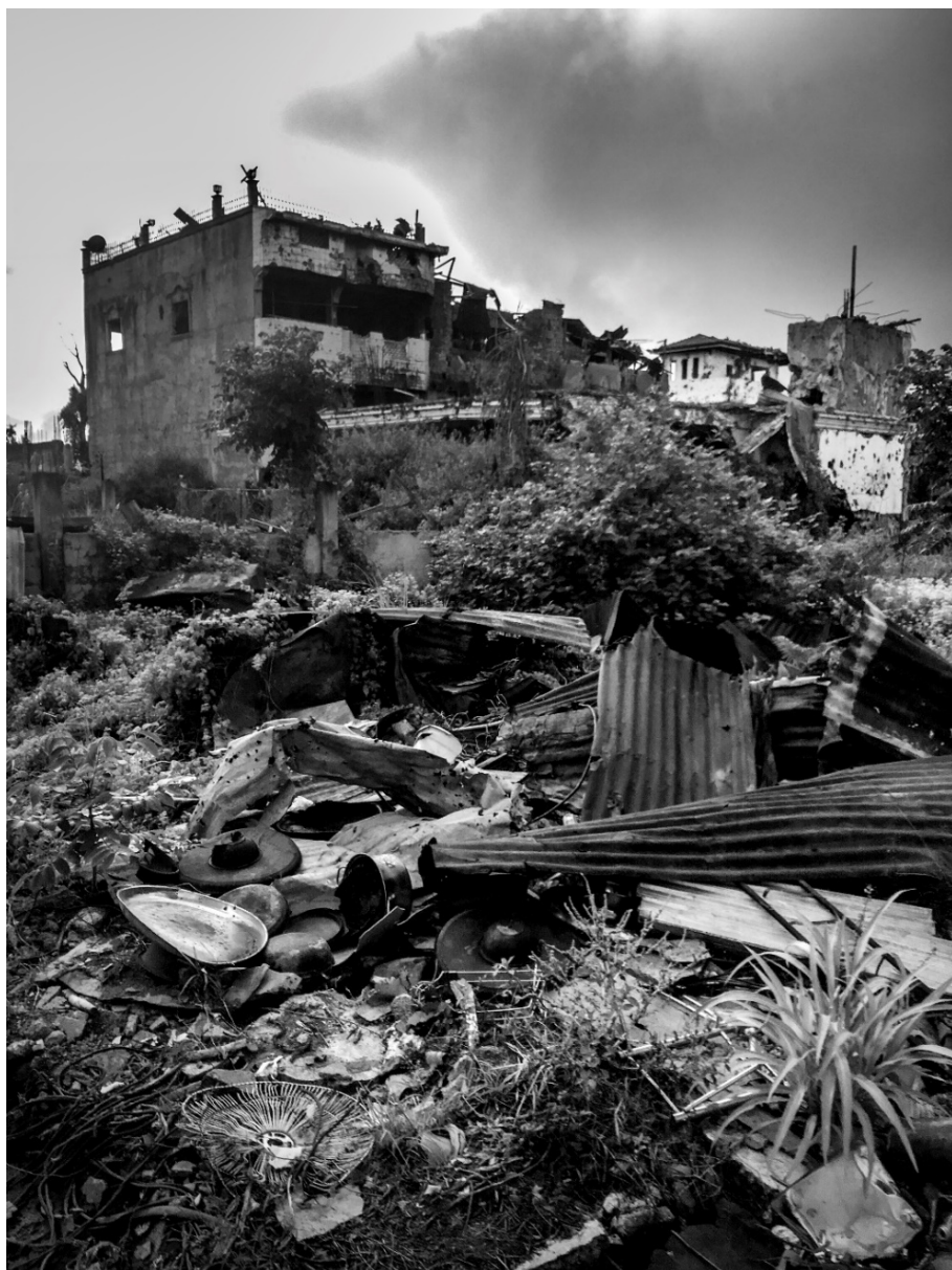
Marawi a year after the war, 2018.