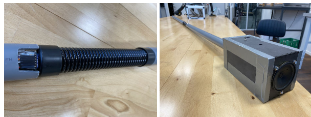
(a) Detail of spring and embedded microphone (b) Detail of box enclosure and speaker