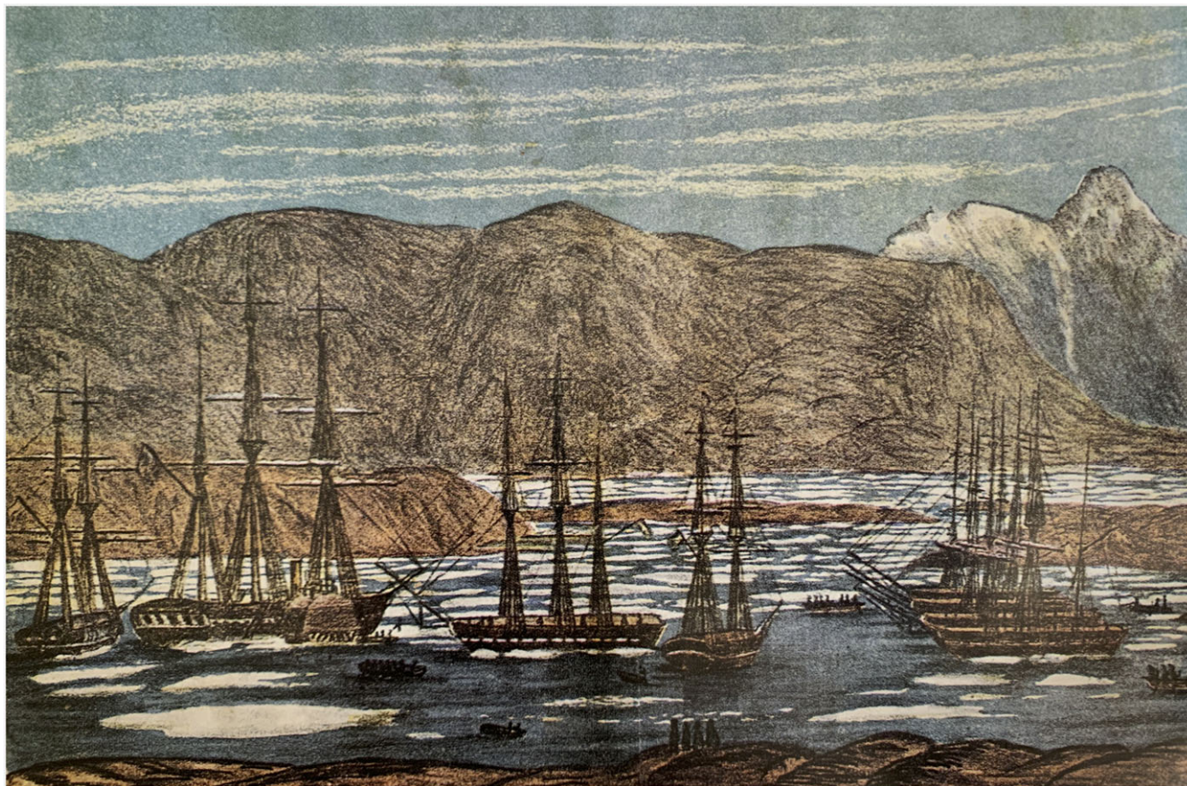
Fig. 3. Woodcut illustrating the 'Fox' and the 'Bulldog' by Rasmus Berthelsen from watercolour by Aron fra Kangeq. For Peer.

It is a curious coincidence that this line along all its points should find populaces who originate from the same lineage – at the one end the Scandinavians, from whom originate the Anglo-Saxons, and at the other their descendants: Americans. This line traverses a triad of countries whose people have the same blood in their veins. But there is another curious similarity; all the governments of these countries are based on true freedom, and it is worth hoping that this line, which will naturally bring dispatches for other countries, with them may also send some of that freedom-spirit, which we are all imbued with.