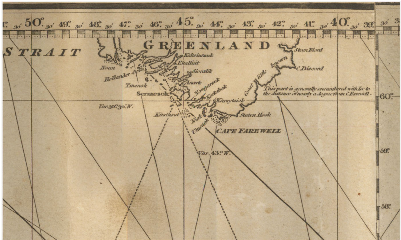
Fig. 2. Detail, a new chart of the Atlantic or Western ocean improved by W. Heather. A new edition. Drawn revised and corrected by J.W. Norie, Hydrographer & co. 1828.

uncharted or only cursorily mapped in 1860, for example parts of Iceland, inland Greenland and North and East Greenland (McCannon, 2018; Zeilau, 1861).