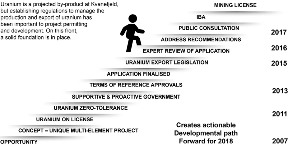
Figure 7.2 A replica of a slide from Greenland Minerals and Energy Limited’s presentation at the PDAC Convention 2018 organized by the Prospectors & Developers Association of Canada.

Uranium is a projected by-product at Kvanefjeld, but establishing regulations to manage the production and export of uranium has been important to project permitting and development. On this front, a solid foundation is in place.