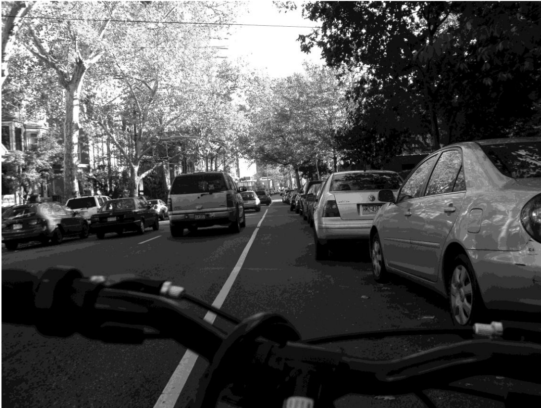
Typical bike lane design in Philadelphia

In part 2 it was stated, that the notion of “biking assemblages” is scalable from e.g. a local block to a region. It was also discussed how values, cultures and norms can be included in the assemblages. This section of the case study will look at “biking assemblages” in relation to bicycle infrastructure and design practices of such in the streets of Philadelphia. With a point of departure in the organization of space in the streetscape and physical design practices regarding curbs, lane widths and signage, the discussion will elaborate on the physical design solutions’ impact on mobility practices, culture, education and politics, and vice versa. The need for implementing “biking assemblages” and thinking holistically about street design is thereby sought articulated.