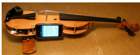
Figure 1. The Overtone Fiddle – first prototype.

The Overtone Fiddle uses a tightly focused sensing approach to capture string vibrations – several designs were attempted, only the chosen method is described herein.