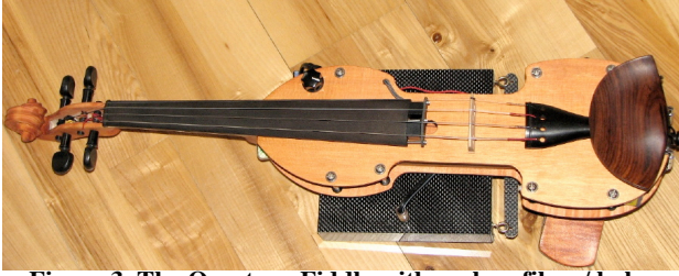
Figure 3. The Overtone Fiddle with carbon fiber / balsa wood second acoustic body mounted underneath.

Designed as a 5.6" x 5.6" x 1.2" box, this second body has a total internal volume of roughly 37.6 cubic inches. To relate this to the spherical shape of a traditional Helmholtz resonator, solving equation 1 below provides the radius of a sphere with an equivalent internal volume. Then, to arrive at the proper size of the soundhole, this radius is divided by four, resulting in a prototype design with a 0.519" radius circular soundhole.