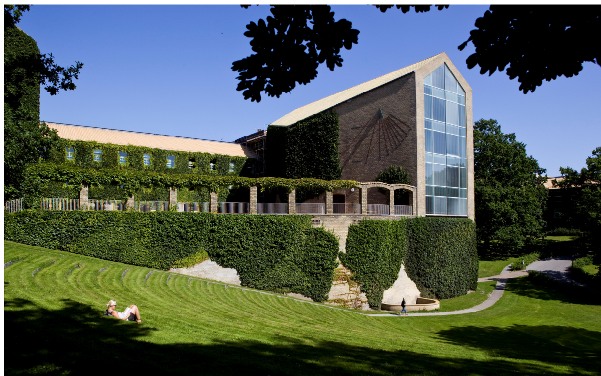
Figure 6. The Aarhus University campus.