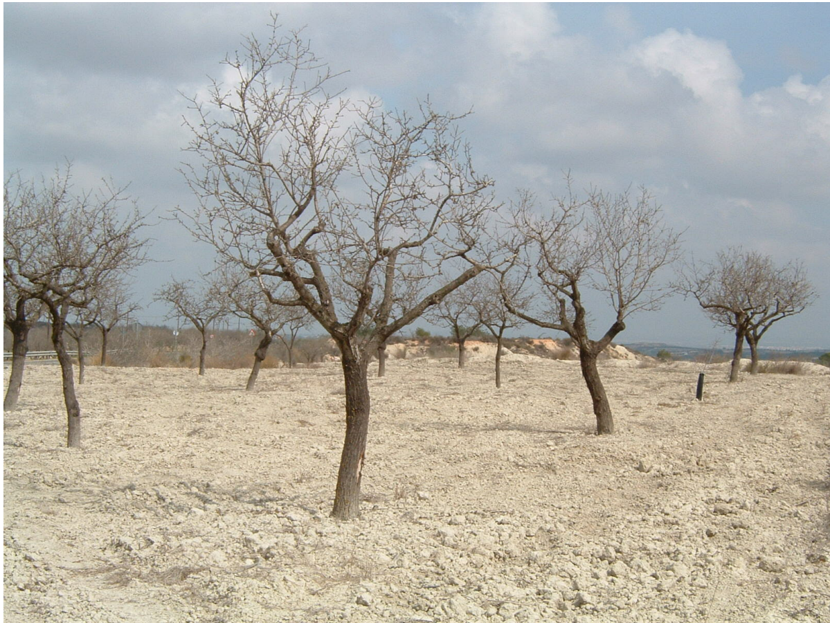
Figure 3. Droughts are projected to become a more frequent and longer lasting under climate change, and this will have severe impacts on food production and food security, in particular in developing countries. It may also compromise some of the ambitions for significantly expanding biofuel production due to lack of water for supporting the biomass production.

To reduce the dependency of society on fossil fuels, there is a high demand for increasing the use of bioenergy and bio-fuels [25]. These renewable energy sources are attracting more and more attention globally, not least because they have the potential to address concerns about climate change, the environment, energy security, and the opportunity to modernise energy services in developing countries. It was the opinion of the participants that this can only be achieved by developing new, highly productive bioenergy cropping systems that make use of land, which is not suitable for food and feed production, and which does not currently have high biodiversity and/or high carbon stocks. In addition, there is a need to better integrate ethical concerns regarding effects of increasing biofuel production on food prices and on biodiversity.