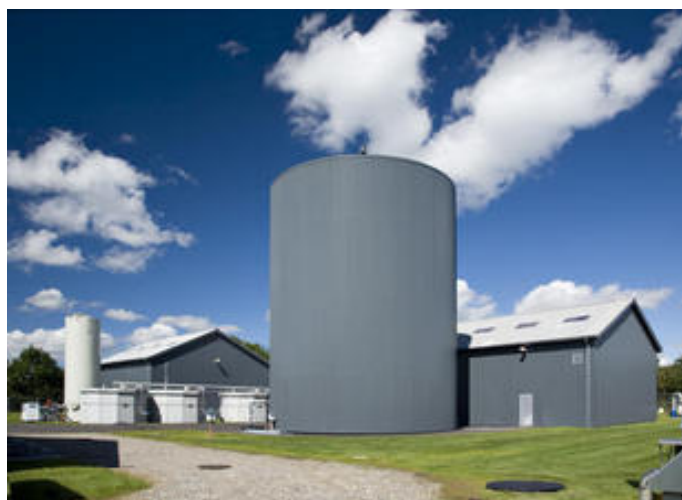
Figure 4. A picture of the worlds largest experimental biogas plant, situated at Research Centre Foulum, Aarhus University.

The greatest challenge facing agriculture during the 21 st century is probably how to feed the increasing not only an increasing population, but also an increasing number of more wealthy people on the Earth, while maintaining high-quality soil and water resources [27]. Climate change significantly adds to this challenge by reducing the quality of soils and the availability of water in many regions through the increasing variability in temperature and rainfall [28]. The already large contribution of agriculture to global greenhouse gas emissions will increase unless more effective and climate-friendly farming systems are adopted [9].