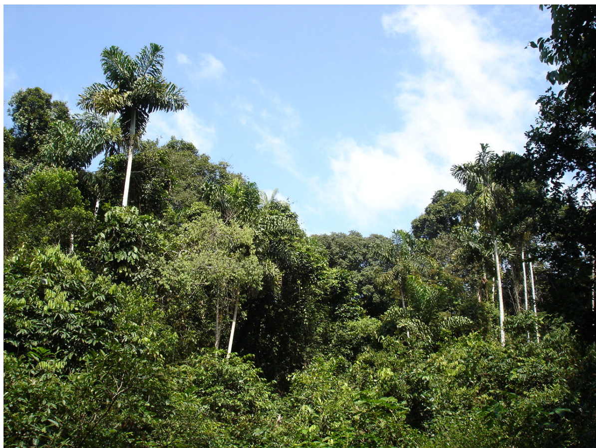
Figure 2. Theme 2 focused on the importance of the climate-biodiversity relationship, not just for nature conservation, but also for the future climate itself. Notably, forest conservation including Reduced Emissions from Deforestation and Degradation (REDD) represents a major and cost-effective climate change mitigation opportunity. One of the key points mentioned in the statement was that biodiversity needs to be an integrated part of the general climate change mitigation and adaptation efforts.

reserve systems, designing reserve systems that are resilient to climate change, climate change-off-setting local management (controlled burning to reduce fuel loads etc.), captive breeding, assisted migration (translocation), engineering new habitats etc. [9, 10, 11, 12].