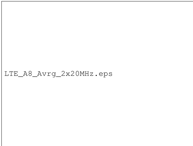
Fig. 4. Average UE throughput and the gain in the average throughput of MIMO UEs over that of SIMO UEs

Figure 4 shows the absolute value of the average user throughput experienced at the MIMO UEs in LTE-Rel'8 and LTE-Advanced systems vs. the offered load. The gain of the MIMO system over SIMO system corresponding to different offered loads is also shown in the same figure. The gain first decreases as the offered load increases as expected. It somehow saturates at the medium offered load and steadily increases at high load. The boost in the gain of the MIMO system over SIMO system at high traffic load is due to the larger bandwidth resource available for the MIMO UEs as described in Section III-B1.