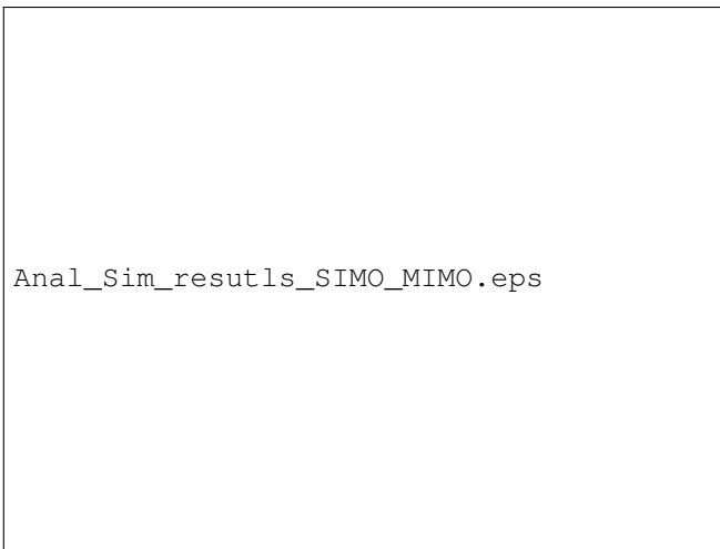
Fig. 5. Simulation and analytical results on the average user throughput of SIMO and MIMO systems

In Figure 5 we compare the user throughput performance obtained from the simulation and from the analytical results. There is a good match between the analytical and simulated results. The difference between the analytical user throughput of the MIMO system and the simulated one is in the order of 10% only. These discrepancies could be due to the limitations in the modeling of the bursty traffic network as well as the simplification in estimating the average user throughput e.g. eq. (6) and eq. (8). Nevertheless, it is shown that the analytical model is capable of capturing the principle behaviors of SIMO and MIMO systems in a bursty traffic network.