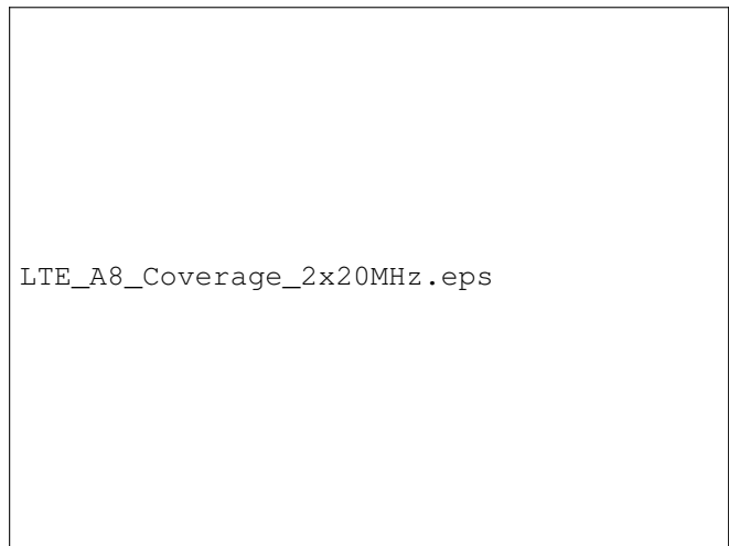
Fig. 3. 5%-ile (coverage) user throughput and the gain in the coverage throughput of MIMO UEs over that of SIMO UEs

2) User throughput performances: Figure 3 illustrates the 5%-ile user throughput obtained in 2x2 MIMO system and its gain over that of SIMO system. The performance of both LTE-Rel'8 and LTE-Advanced UEs are shown on the same figure. From low to medium traffic load the gain in the 5%-ile is flat with an average value of 25% for LTE-Advanced UEs. For LTE-Rel'8 UEs, the gain is reduced from 25 % to 0%. A steady increase in the gain at higher traffic loads is observed for both types of the UE.