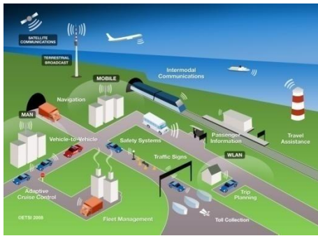
Figure 2: ITS is not limited to individuals, but must be available to all for pre-planning, on the road and in the evaluation phase.

This means that there is an applicable technology platform, an accurate map-database and a willingness among the drivers to enable this plethora of new customizable service initiatives like: