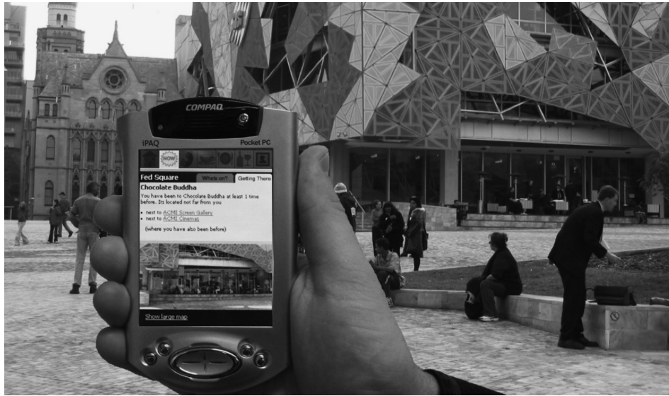
Fig. 7. Just-for-Us: indexing to the user's physical surroundings and history of visits.

indexical references to further extremes than in the previous two designs, in order to gain deeper insight into the use of mobile user interfaces with this particular characteristic.