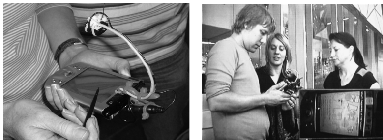
Fig. 11. Wireless camera on PDA and video recording of participants, interviewer, surroundings and screen.

as well as unobstructed user interaction (Figure 11). Users and interviewer were wearing wireless directional microphones.