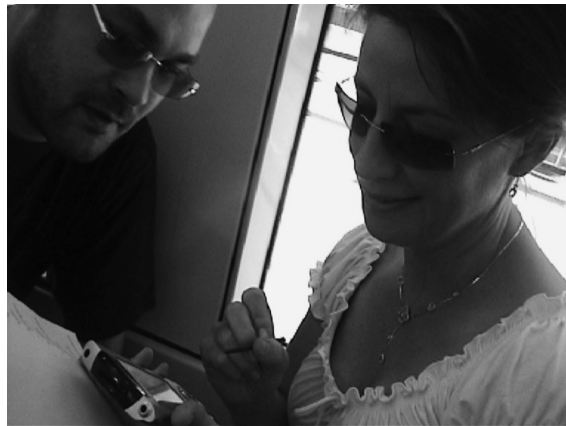
Fig. 8. Field evaluation of TramMate II on board a tram in Melbourne, Australia.

not only in laboratory settings. In the following, we describe the evaluations of the three prototypes involving a total of 62 users.